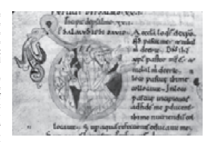
Plate 3: Le Mans, Bibliothèque Municipale, MS 228, f. 37v)

The familiar menagerie of Romanesque animals inhabits many initials. How much these contribute to the meaning of the letters is debateable. The animals fall into three groups: purely decorative, clearly narrative and problematic. Frequently, decorative animal heads spew the bow of the letter, like D in Psalms 13 and 14. In other cases they are clearly part of the narrative of the psalm. The tail of Q in Psalms 41, 51, 79 and 90 is provided by a dragon who interacts with the figures in the letter and whose presence can be justified by textual sources. Psalm 90 illustrates precisely 'Thou shalt trample under foot the lion and the dragon'. Psalm 41 draws on the familiar image of stag and serpent, mentioned by Augustine and Physiologus. In Psalm 51, the image of a woman whose heel is attacked by a dragon derives from God's curse on the serpent in Genesis 3:15. The dragon, trapped at the bottom of the initial by the ring of the letter, in Psalm 79 may be a gloss on the words 'Things set on fire and dug down shall perish at the rebuke of thy countenance.' But the dragons in psalm 53 and 5, who busy themselves exclusively with forming the letter, do not add noticeable meaning to the illustration.